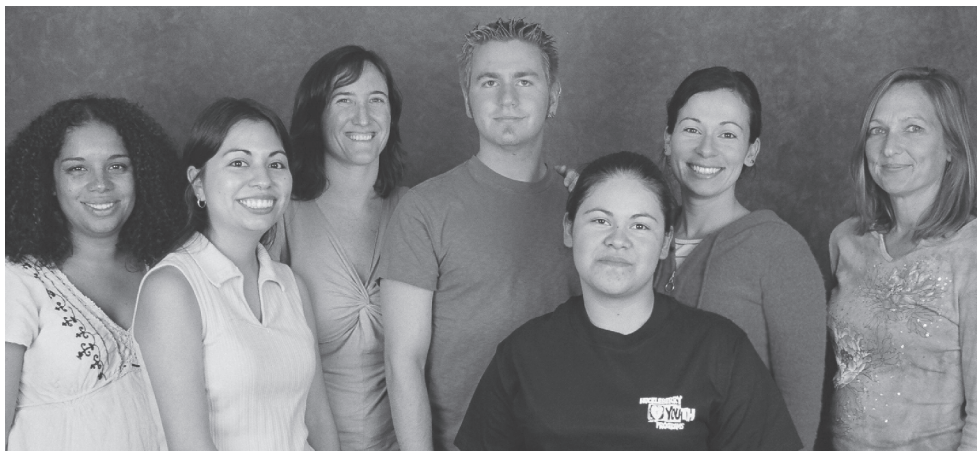
Huckleberry Teen Health Program staff is gearing up for the opening of the Novato Wellness Center this summer.

If the program continues to thrive at Wallenberg and Aim High, Huckleberry Youth Programs hopes to offer in-school services to more youth. Currently, only Medi-Cal clients are being offered counseling services, while other students are referred directly to HYP. The goal of the program is to eventually offer the services to non-Medi-Cal clients and introduce different modalities, such as group therapy at the school sites.