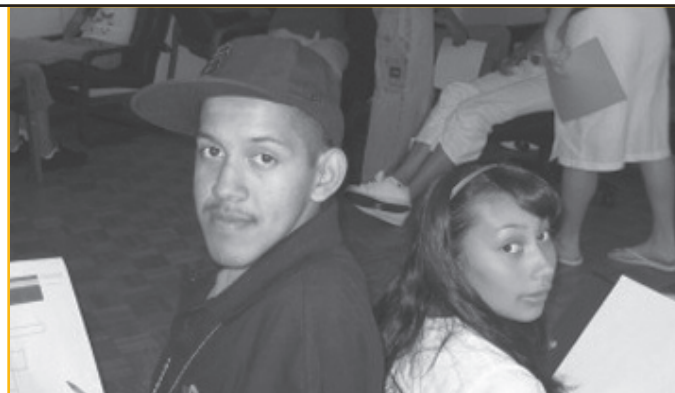
Two young people participate in a Youth Leaders In Progress workshop.